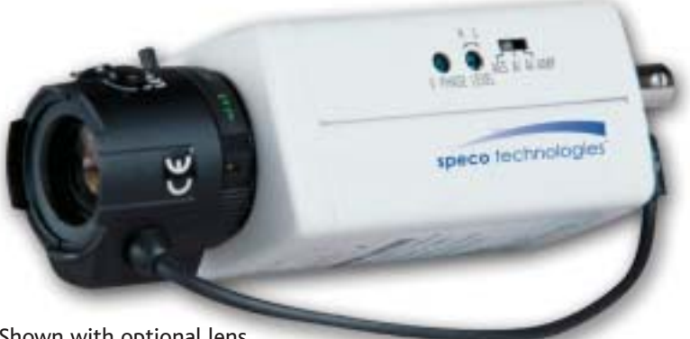
Shown with optional lens

The CVC-190 is the only B/W camera you will ever need. It can operate on either a 12V DC or a 24V AC power supply (not included). It offers 420 lines of resolution with 0.02 lux sensitivity. It also has a 1/3 inch B/W image sensor, internal synchronization, and a built-in electronic shutter. It supports both video and DC drive auto iris lenses. The camera accommodates both C/CS lens types, sold separately